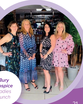
Bury Hospice Ladies Lunch