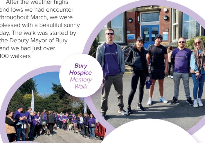
Bury Hospice Memory Walk

To keep up to date on the events throughout the year visit our website www.buryhospice.org.uk/ events or keep an eye on our social media for updates throughout the year.