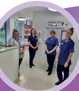
Bury Hospice Outreach nurses

For more information on the services we offer visit our website www.buryhospice.org.uk