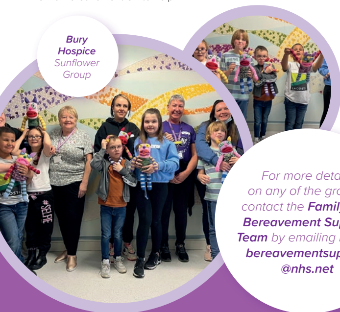
Bury Hospice Sunflower Group

For more details on any of the groups, contact the Family and Bereavement Support Team by emailing bhosp.bereavementsupport@nhs.net