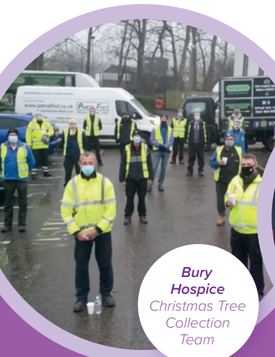
Bury Hospice Christmas Tree Collection Team

on the day with a range of ages and a few furry friends joined in too. We were delighted to be joined by Radcliffe Brass band who provided the entertainment for the pre-walk period. Then at the end of the walk we had a host of stalls set up with a DJ in place to bring a party atmosphere to the Hospice. The event raised just over £14k which was amazing. ➤