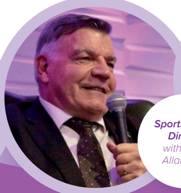
Sportsman's Dinner with Sam Allardyce